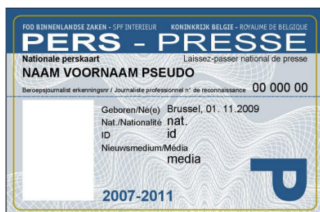
Belgium Press Card (front)

The solution found in Belgium is linked to the National Press Card. According to the Law of 30 December 1963, journalists recognised by the national union are issued with a press card, which gives the journalists maximum access to any public space, including demonstrations. On the back of the press card, it is stated: "The authorities are requested to give the owner of this card all facilities in as far as they are compatible with the needs of public order and traffic."